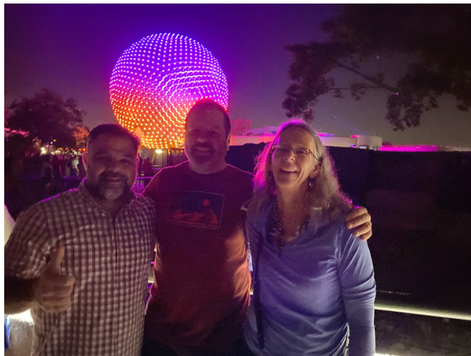
NEOA's leadership delegation after a hard day of work at the COE Board Meeting